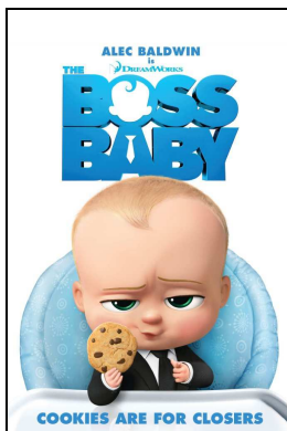
The Boss Baby (2017)

Plot: The Incredibles 2 follows the adventures of the Parrs, a family of Supers, who are humans with extraordinary abilities. Mr. Incredible, the father, is super strong, Mrs. Incredible, the mother, is called Elastigirl, and she can stretch her body amazingly. Even Violet, Dash and Jack-Jack, their three children have super powers!