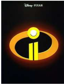
The Incredibles 2 (2018)