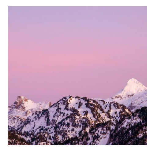
Larra-Belagua